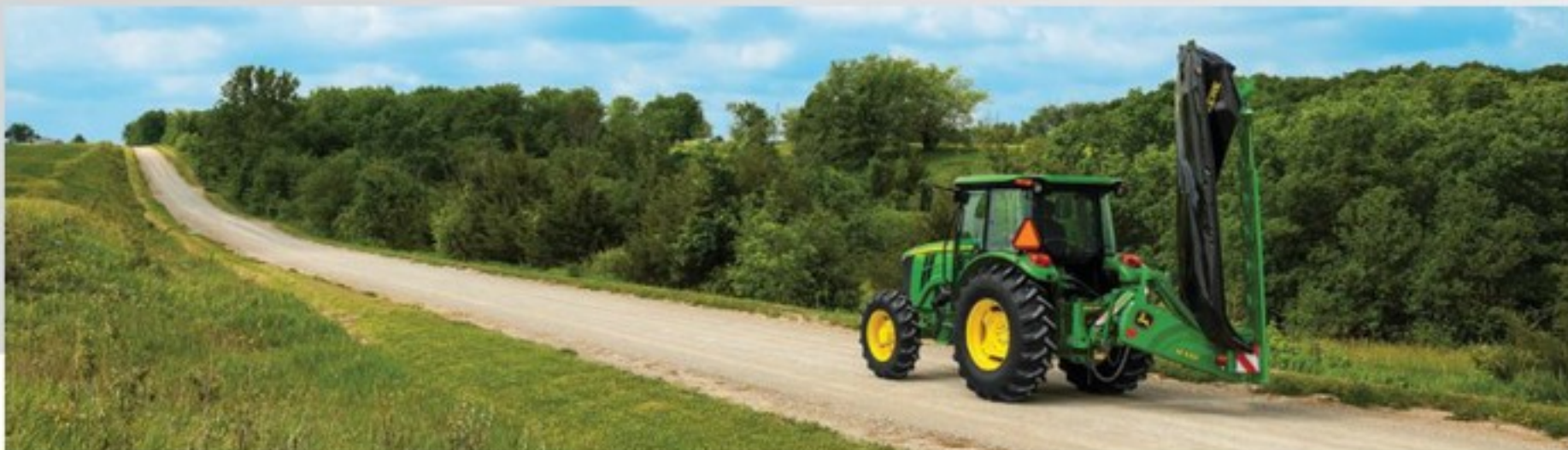
These mowers fold up for transport right from the seat. Your tractor hydraulics do all the work.

In addition to offering these new John Deere R Series Disc Mowers, your John Deere dealer also offers a new line of Frontier-branded 50 Series Disc Mowers – providing excellent cutting performance at a budget-friendly price. Please take a closer look at page 20. Better yet, visit your John Deere dealer.